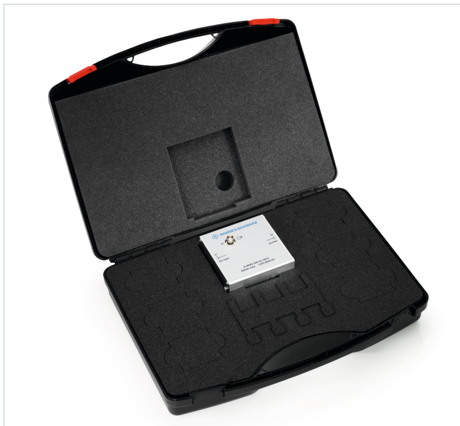
R&S®ENY81-CA6 base unit in carrying case.

1) The calibration data includes asymmetrical impedance and phase, voltage division factor, decoupling attenuation, longitudinal conversion loss (LCL), transmission bandwidth and crosstalk.