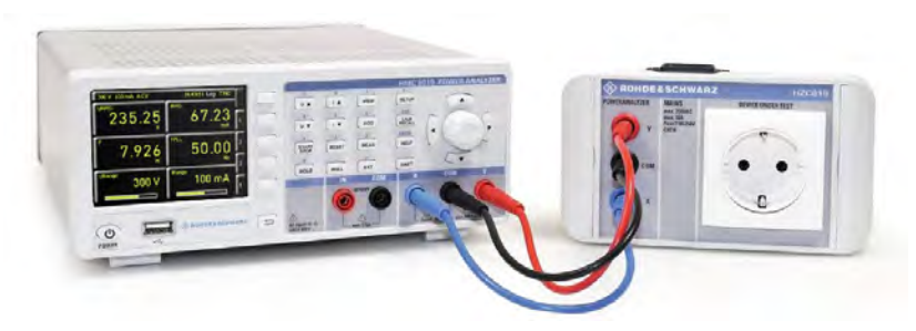
R&S®HMC8015 power analyzer with the R&S®HZC815 adapter