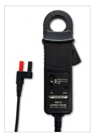
R&S®HZC51 AC/DC current probe

The R&S®HZC815 adapter makes it easy and safe to connect a DUT to the R&S®HMC8015. The DUT is powered via the appliance coupler on the top of the adapter.