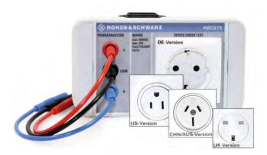
DE, UK, CHN/AUS and US versions of the R&S°HZC815