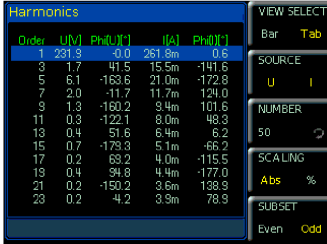
Harmonic analysis: tabular display