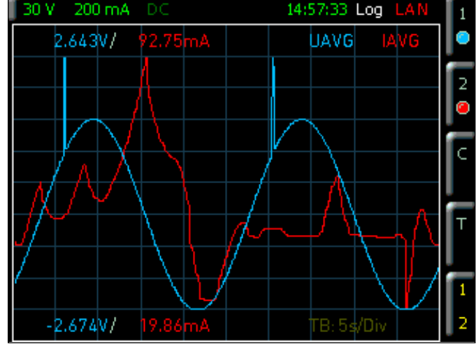
Trend chart function