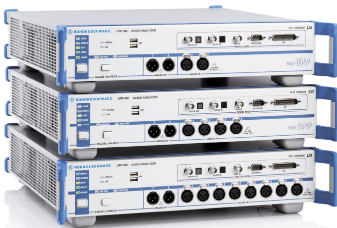
The R&S®UPP audio analyzer family.

Combining the R&S®UPP audio analyzers with the R&S®SMB100A signal generators provides the most compact and fastest test solution for modern FM car radios