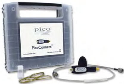
PicoConnect™ 900 Series probe