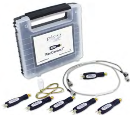
PicoConnect™ 900 Series kit