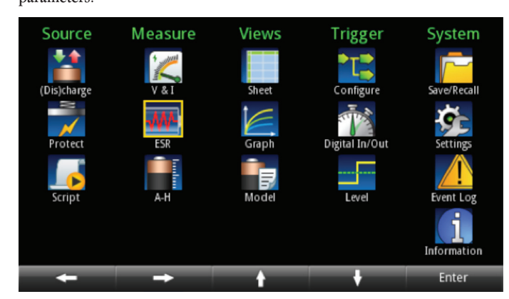
Figure 6. Battery test menu.

The bright, 4.3-inch TFT display shows voltage, current, and amp-hour readings, source settings, and many additional settings in large, easy-to-read characters. The icon-based main menu provides all the functions users can control and program for fast access to source setup, measurement setup, display formats, trigger options, and system settings. Menus are short, and menu options are easy to find and are clearly described, enabling test parameters to be setup quickly by using the navigation wheel, keypad, or soft-keys. Many setup parameters, such as voltage and current settings, can be entered directly from the home screen; less complex tests don't require access to the main menu to make adjustments - just use soft keys on the home screen. Whether test requirements are simple or complex, the Series 2281S supplies provide a simple way to set up all required parameters.