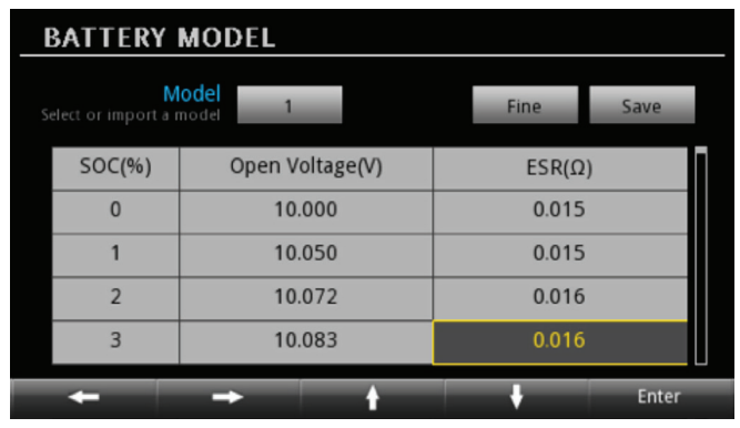
Figure 5. Battery model.