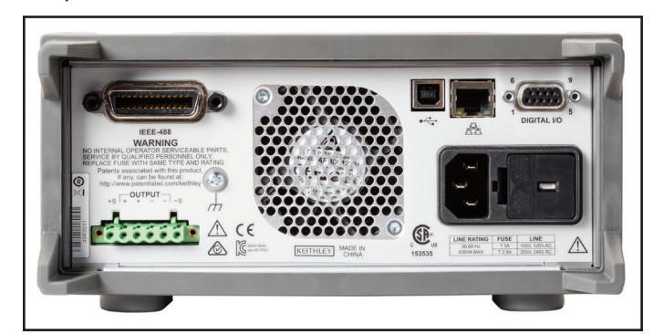
Figure 7. 2281S rear panel.

A choice of front or rear panel terminals provides enhanced connection flexibility. For maximum voltage accuracy, 4-wire remote sensing ensures that the output voltage programmed is actually the level applied to the load. In addition, the sense lines are monitored in order to detect any breaks in them. These features ensure that any production problems can be quickly identified and corrected. Series 2281S supplies can be controlled via their built-in GPIB, USB, or LAN interfaces. The USB interface is test and measurement system (TMC) compliant. The LXI Core compliant LAN interface supports controlling and monitoring a Series 2281S supply remotely, so test engineers can always access the power supply and view measurements, even if located on a different continent than the test systems.