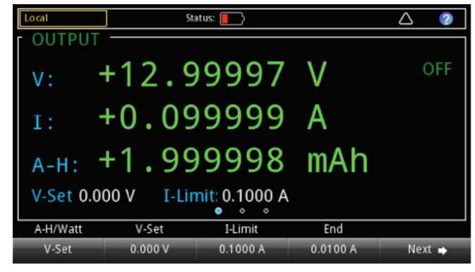
Figure 4. Battery test display.

After the test, a battery model can be generated based on the measurement result of the battery charging process. A battery model can be edited, created, imported, or exported in a CSV file format.