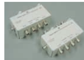
9268 DC BIAS VOLTAGE UNIT Maximum applied voltage: \pm 40 V DC 9269 DC BIAS CURRENT UNIT Maximum applied current: \pm 2 A DC