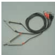
9140 FOUR-TERMINAL PROBE DC to 100 kHz