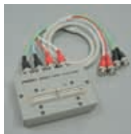
9261 TEST FIXTURE DC to 5 MHz