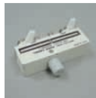
9262 TEST FIXTURE DC to 5 MHz