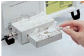
Example of connecting the 9262 and 9268 / 9269

The 9268 can be used for voltages up to a maximum of DC \pm 40 V. The 9269 can be used for currents up to a maximum of DC \pm 2 A.