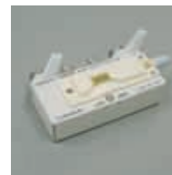
9263 SMD TEST FIXTURE DC to 5 MHz