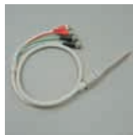
9143 PINCHER PROBE DC to 5 MHz