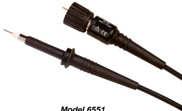
Model 6551 Microline Passive Oscilloscope Probe with Readout Actuator