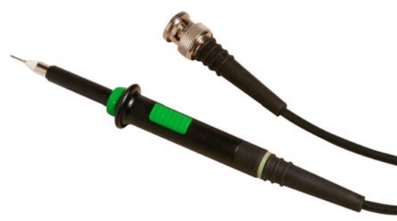
Model 6499 Modular Passive Oscilloscope Probe