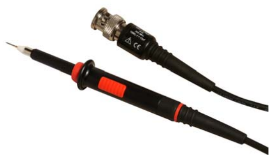
Model 6495 Modular Passive Oscilloscope Probe