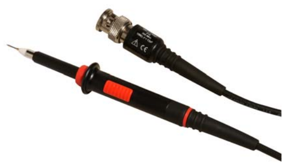
Model 6491 Modular Passive Oscilloscope Probe